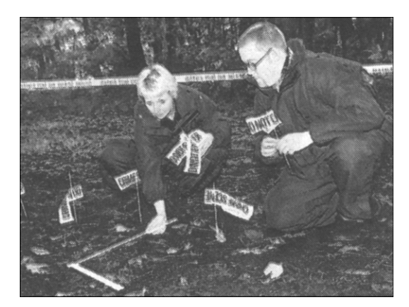
Police officers at work

F OR the first time, a British police force is being taught to use traditional native tracking skills to catch housebreakers, thieves and murderers.