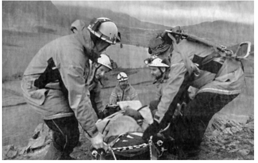
In action: mountain rescuers in the Lake District

Summer is the busiest season for the volunteers who save those stranded in the mountains. Tony Durrant reports