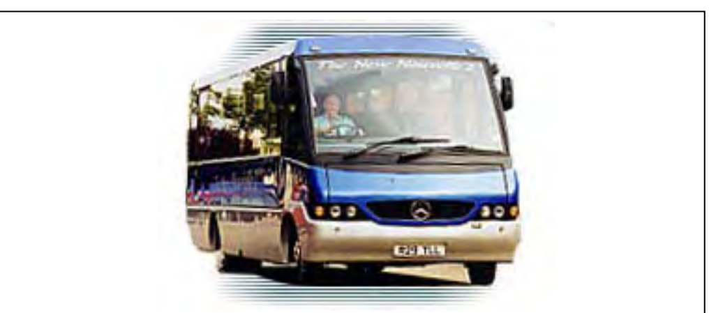
Security stepped up for school parties