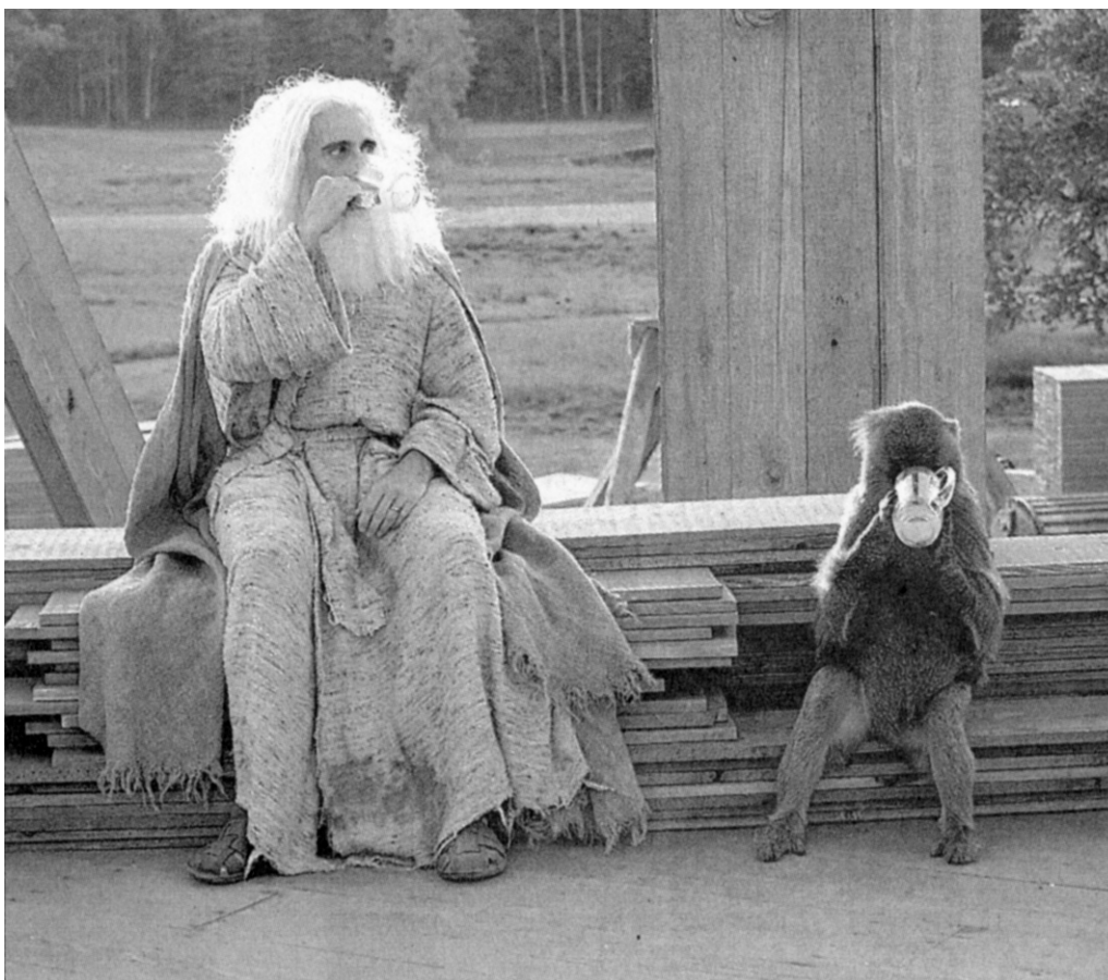
Steve Carell and a fellow boat mate take a break from building the ark in “Evan Almighty.”